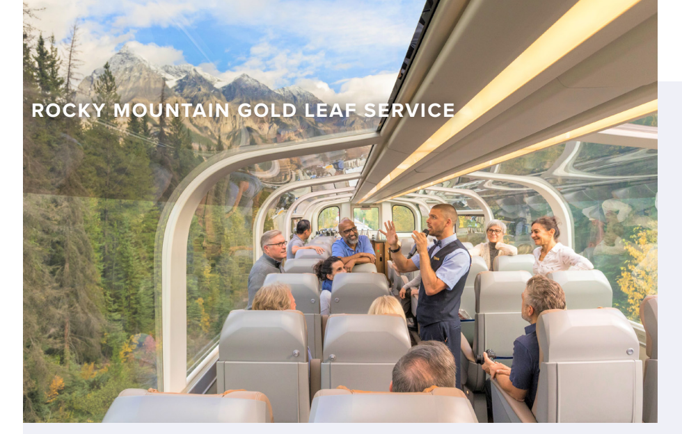
All aboard the Rocky Mountaineer Train for the experience of a lifetime on the 'most spectacular train trip in the world!" Experience Rocky Mountaineer's Gold Leaf Service featuring the Bi-level Glass Dome Coach for panoramic viewing, gourmet breakfasts and lunches created by Executive Chefs, morning scones and afternoon wine & cheese, and exclusive outdoor viewing platform revealing a non-stop parade of glorious living postcards!

Tunnels, Kicking Horse Canyon and Rogers Pass. Overnight in Kamloops.