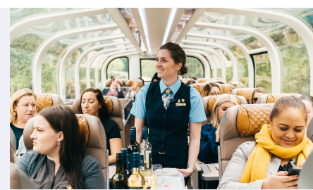
Complimentary Wine & Cheese